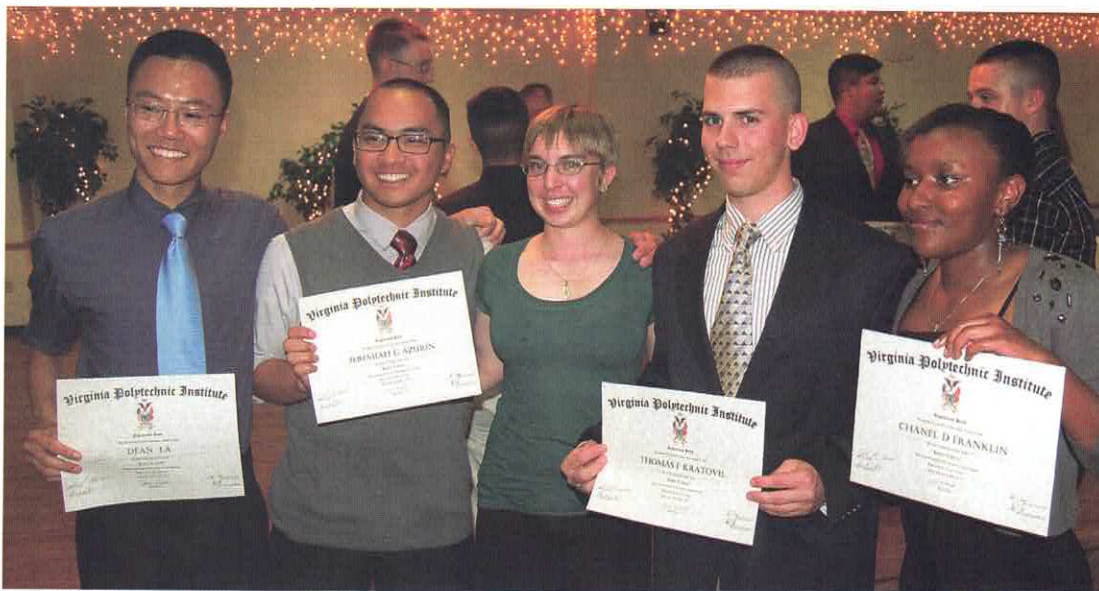
Bottom Photo: This picture shows five members of the HT Class of 2015 with their certificates. The certificates are given out to the freshman at the Highty-Tighty Banquet as they complete their freshman year, making them all official Highty-Tighties.