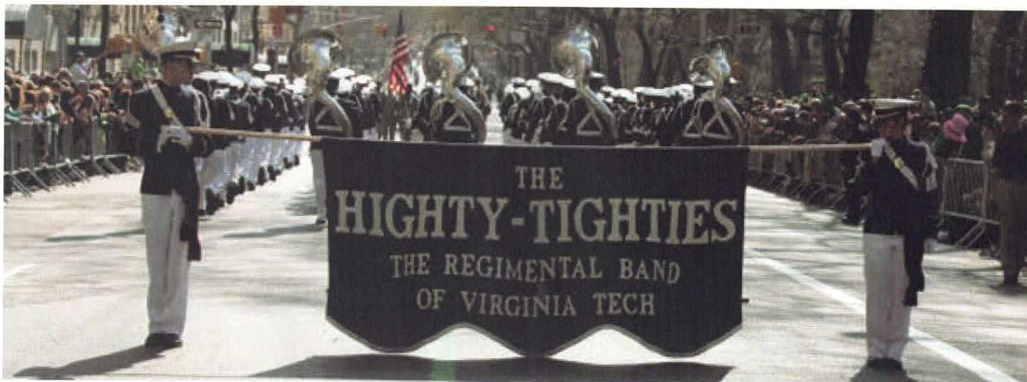
The Highty-Tighties performed very well at the annual St. Patrick's Day Parade in New York City, winning first place in their division and keeping the crowd entertained with counter-marches.