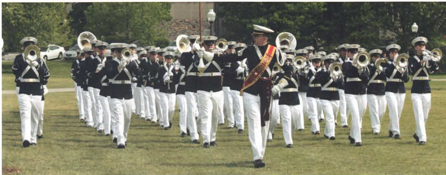
The Highty-Tighties perform during the 2012 VTCC Change of Command Ceremony on the drillfield.

Another fulfilling semester lies ahead for the Band, with its deep history and profound pride extending far beyond my time and yours. I know that I do not stand alone when I say we are ready to add to our illustrious history and my classmates and I look forward to leading the Band to new levels and spreading our great name. HIGHTY-TIGHTY!