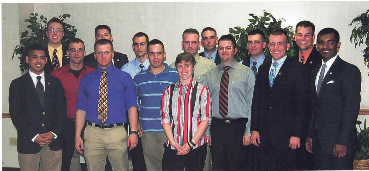
Top Photo: The newest members of the Highty-Tighty Alumni. The HT Class of 2012 pose for a quick photo after receiving their alumni pins at the annual Band Banquet.