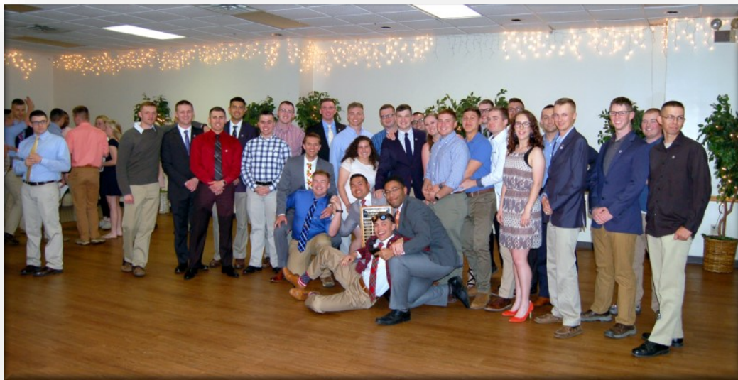
Our newest alumni, the Highty-Tighty Class of 2018!