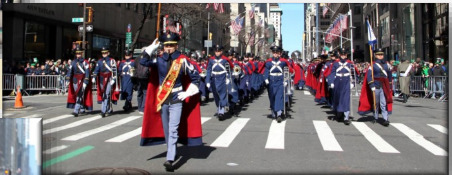
The band performs another counter march looking sharp as always .