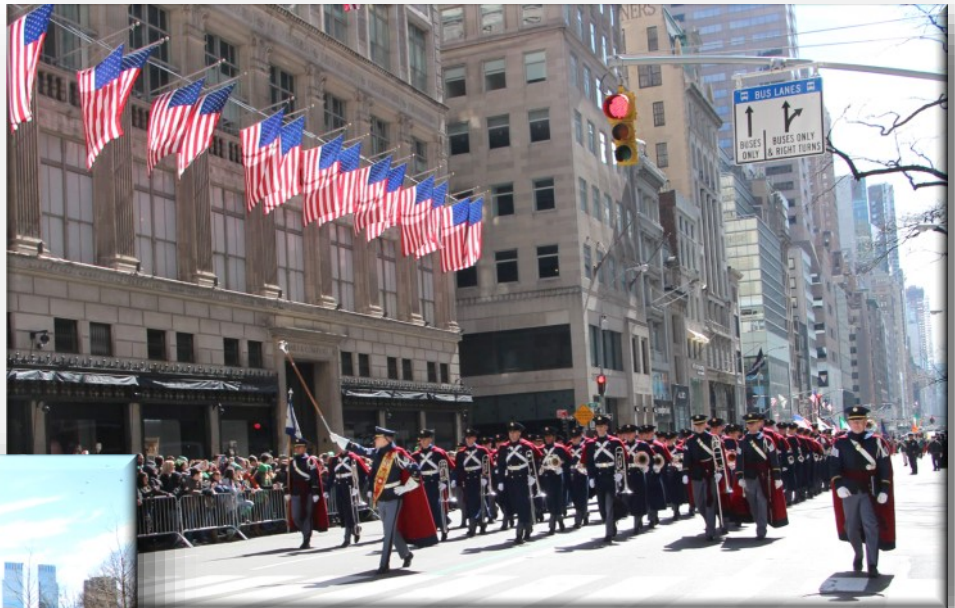
Highty-Tighties pass by Saks 5th Avenue