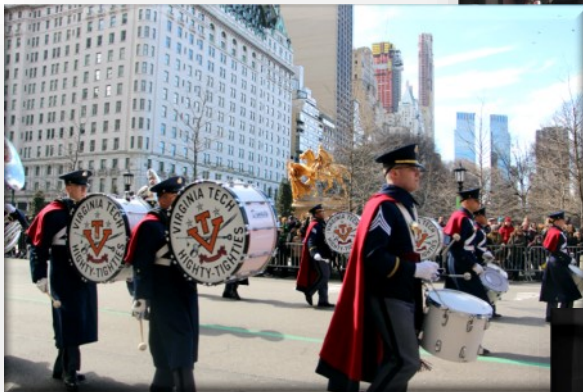
Highty-Tighties pass The Plaza Hotel and Central Park