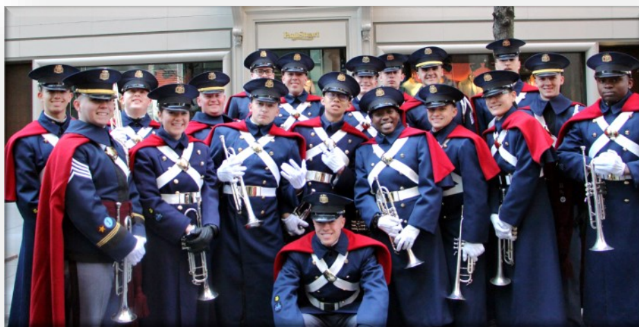
Trumpet section in a lighter moment at the St. Patrick's Day Parade