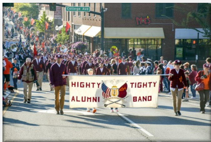
Alumni Band approaches campus in the homecoming parade 2017.